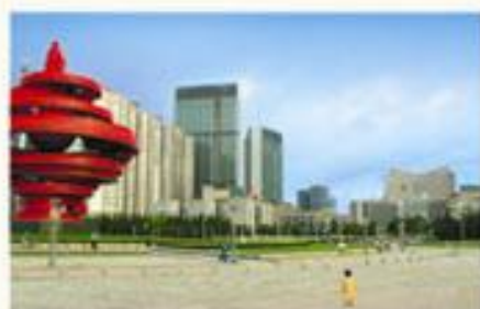
国际贸易部设在青岛颐和大厦 International Business Department Located in Top Yhe International Building, Qingdao