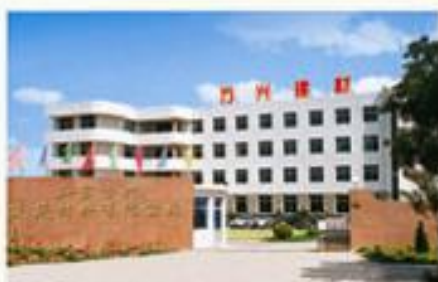
莱州工业园区办公楼 Office Building Located in Laizhou Industry Park